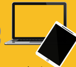
iPad or Laptop