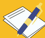
paper and pen