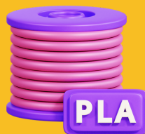
Filament for your Machine